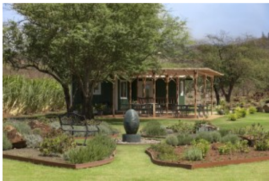
Martini Garden and Gift Shop.

In addition to producing what I can attest to as a very nice, smooth vodka, this place is also very green: The Ocean Vodka Organic Farm and Distillery utilizes solar panels to power 100% of the operations of the distillery and facility. The sugar cane is organically farmed on rich, volcanic soils without the use of synthetic pesticides or herbicides, and mature sugar cane stalks are hand-harvested for processing.